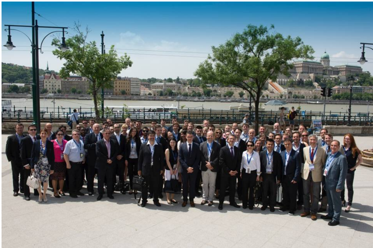
ESSR Annual Meeting 21-24. May. 2014- Budapest – Hungary – Family Picture ☺